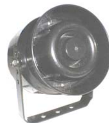
Main alarm unit fits under bonnet or behind front grille