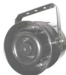
Optional second speaker behind rear bumper for even louder sound output